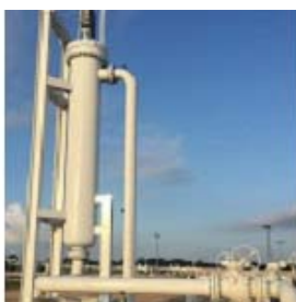
Single-Unit AOT installed on KMCC's pipeline, capacity of 200,000 BBL/Day.

The second AOT commercial installation was performed in March 2015 on the Kinder Morgan Crude & Condensate pipeline (KMCC), a 200,000 barrel per day pipeline providing takeaway for the Eagle Ford Shale in South Texas, primarily delivering crude oil condensate. Delivery and installation of this unit further demonstrates our proven ability to build, deliver and operate our AOT equipment on a high volume commercial pipeline. This prototype was installed and passed all safety and pre-start inspections as required by KMCC. See Form 8-K filed on July 21, 2014 (KMCC Lease and Option to Purchase Agreement).