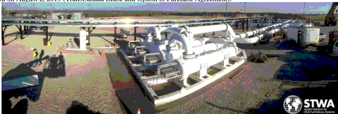
4-Unit AOT installed on TransCanada’s Keystone Pipeline, cumulative capacity of 600,000 barrels per day.

We have proven our ability to build, deliver and operate AOT equipment on a high-volume commercial pipeline by manufacturing, delivering, installing and operating on two North American high-volume commercial pipelines. The first commercial deployment of AOT occurred on the Keystone Pipeline in Udall, Kansas in May 2014, utilizing four AOT pressure vessels in parallel for a cumulative capacity of 600,000 barrels per day. See Form 8-K filed on August 2, 2013 (TransCanada Lease and Option to Purchase Agreement).